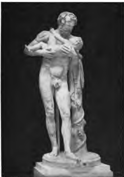
Fig. 47. Silenus with Dionysus.

called Bacchan'tes, who celebrated his worship by wild dances, the clashing of cymbals, the beating of drums, shrill flutings, and unrestrained shouts. Always so accompanied, Bacchus traveled over the world, teaching the cultivation of